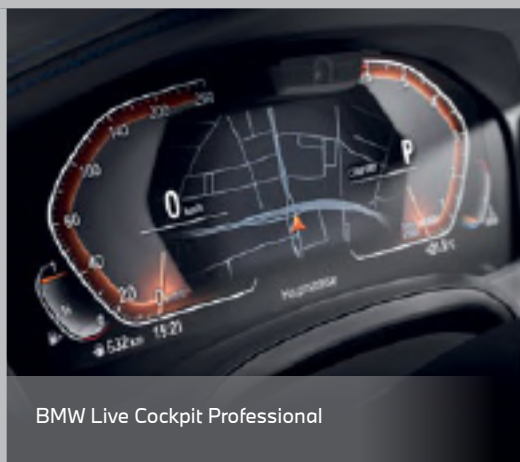
BMW Live Cockpit Professional